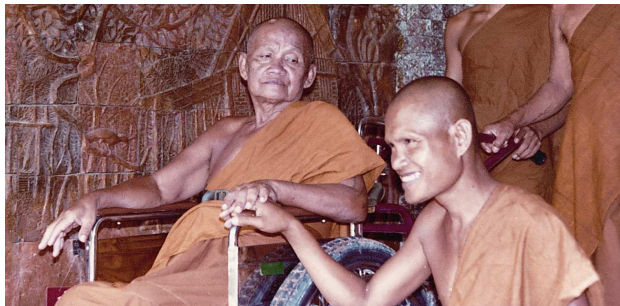
Luang Por Chah